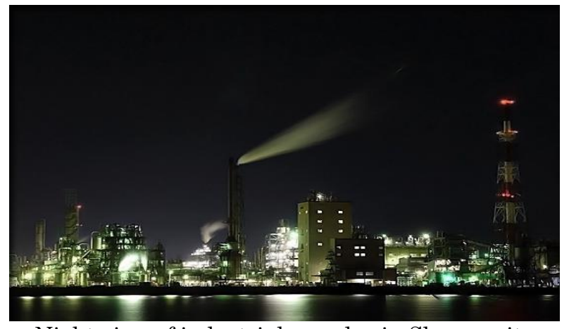
Night view of industrial complex in Shunan city

The annual turnover of these companies is the highest in West Japan, and reaches several trillion yen. Therefore, the service-producing industry of the eating of Shunan city etc. develops, and offers an enough part-time job for the international student.